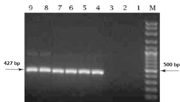
Fig 1. PCR analysis. The 427 bp specific fragment from IS1245 . Lane M, DNA size marker (100 base pair ladder). Lane 1 and 2, negative controls (distilled water). Lane 3, negative species control ( Mycobacterium bovis AN5 strain, ATCC number 35726). Lane 4, positive control ( Mycobacterium avium subsp. avium D4 strain, ATCC number 35713). Lane 5 to 9 samples tested for Mycobacterium avium subsp. avium

In this study IS901 -RFLP typing using Pvu II was successfully conducted on 40 MAA isolates from naturally infected of domestic pigeons ( Columba livia var. domestica ) and produced 7 patterns. The majority of isolates (60%) were RFLP type PI.1 and in comparison this type was the most similar type to standard strain, however all the patterns obtained in this study, were different from the standard strain ( Mycobacterium avium subsp. avium D4 strain, ATCC number 35713). In addition no common pattern between this study and the only another similar study in Tabriz-Iran (which is not published) was found and it indicates that the sources of their infection were not same.