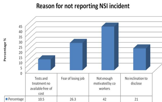
Fig. 3. Reasons for not reporting NSI incident

less motivation followed by fear of losing job.