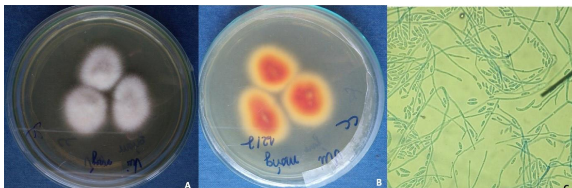
Fig. 3. Fungal cultivation characteristics: (A), (B). Macroscopic morphology on PDA, (C). Microscopic morphology in Lactophenol cotton blue staining at 400× magnification.