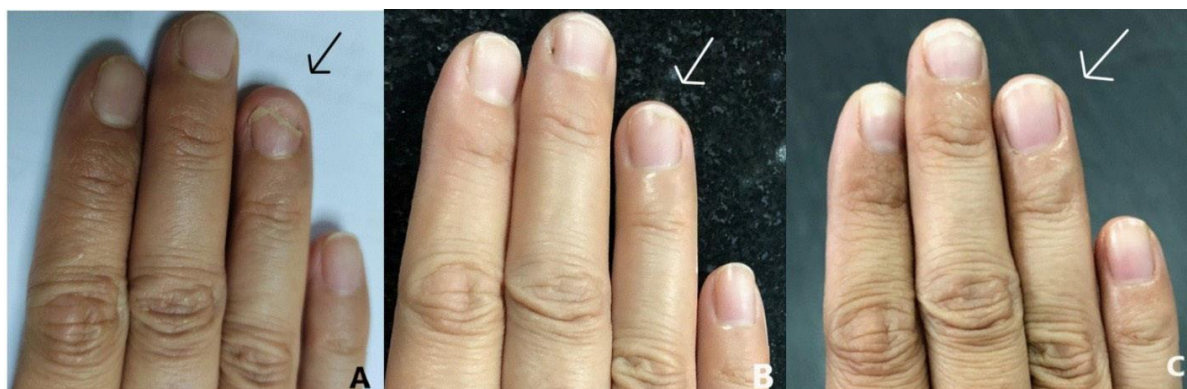
Fig. 1. Patient fingernail (with the arrow): (A). At the beginning of treatment; (B). After two months of treatment; (C). One-year follow-up after treatment.