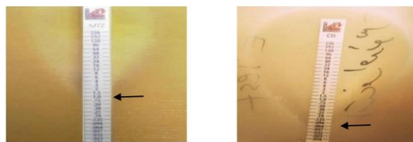
Fig. 2. Elliptical inhibition zone appears around the strips due to increased antibiotic concentration