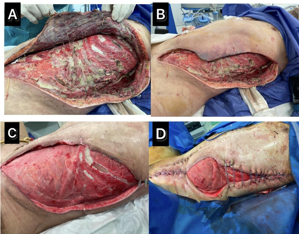
Fig. 2. A, B: debridement and wound irrigation after seven days. C: wound condition and granulation tissue formation after 14 days and vacuum-assisted wound therapy D: wound condition after 28 days