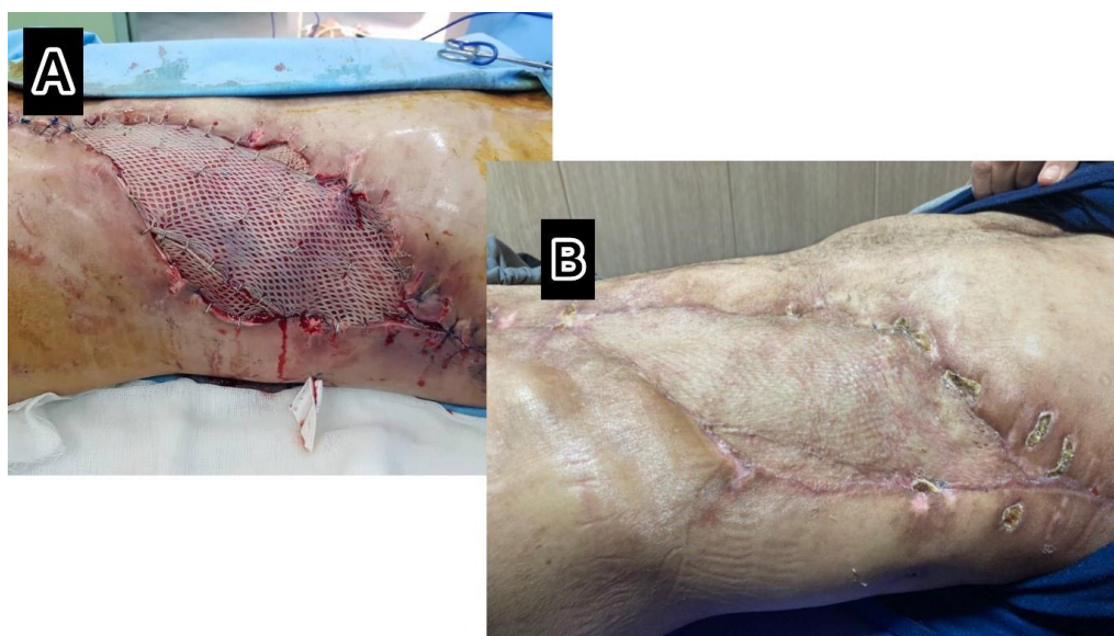
Fig. 4. A: Skin grafting after 35 days. B: Final result after 60 days