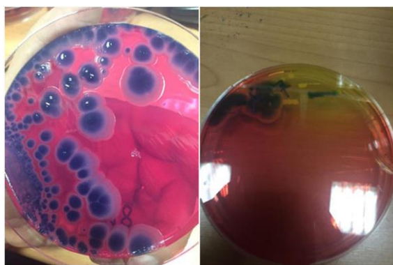
Fig. 3. HiCrome™ Bacillus Agar showing Blue large flat colonies with blue center of Bacillus cereus (Left) and yellowish green colonies of Bacillus subtilis (Right).

non-diseased truly excluded by the test (TN) among total non-diseased cases (TN+FP).