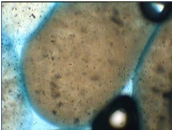
Fig. 1. Optical microscope image of coated yeast breads at 400× magnification.

for up to 2 h (control condition). But variations in counts of free and microencapsulated S. cerevisiae during incubation period at SGJ and SIJ were significant (Table. 1). However, results show there were significant reductions of free yeast in immediate exposure to pH 2 and 8. After 120 min incubation in