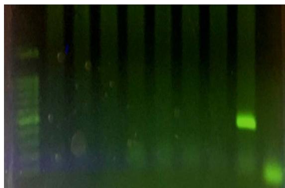
Fig. 2. Agarose gel electrophoresis of C. pecorum species-specific Nested-PCR: left to right: 100 bp DNA ladder; seven negative samples; positive control (426-441 bp); negative control (distilled water).