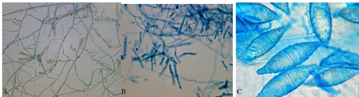
Fig. 1. Presents microscopy of some dermatophytes species have been identified from the samples related to this study.

A. Epidermophyton flucozum with macro and micro conidia ×40.